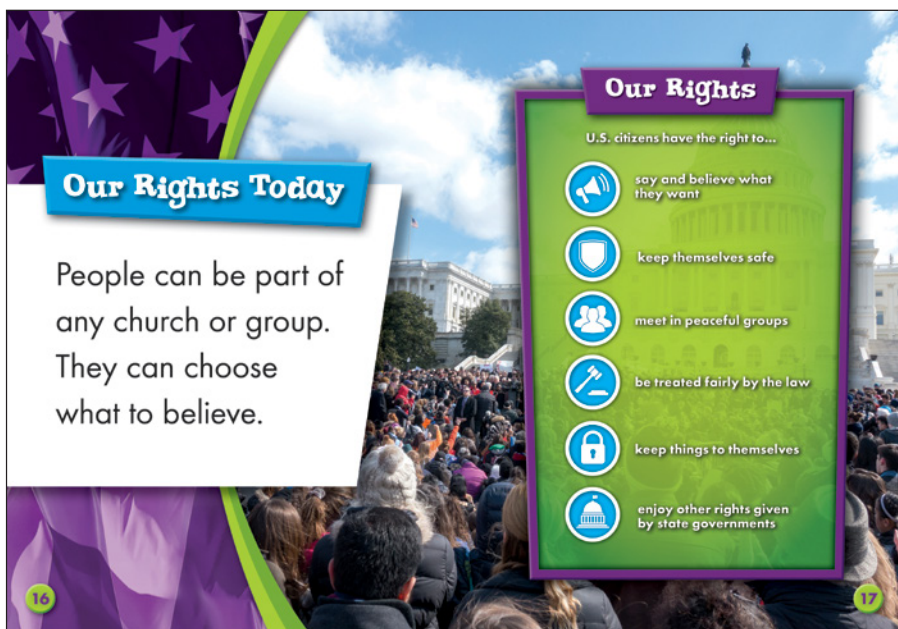
Sample spread from The Bill of Rights